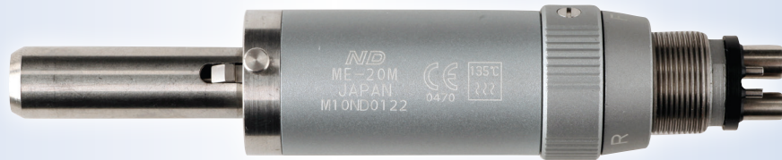
Model#: ME-20M 20,000rpm Airmotor